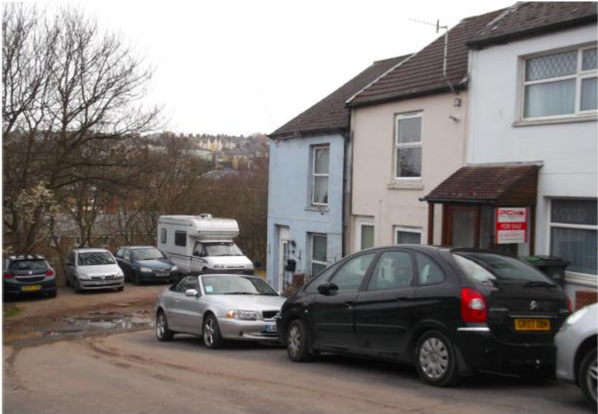
Northern end of Sandown Road picturing un-adopted parking area