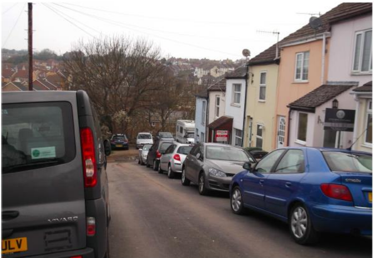
View north on Sandown Road.