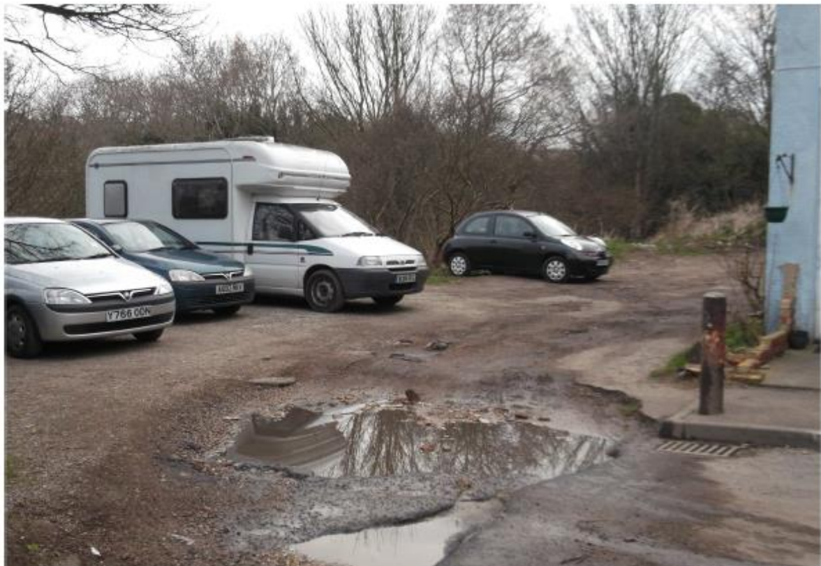
Un-adopted parking area surface condition pictured