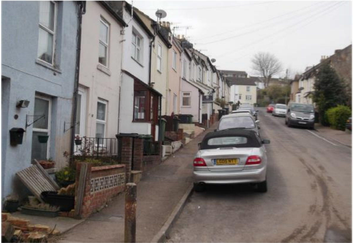
Applicant's property pictured 2 nd from left. View south on Sandown Road.